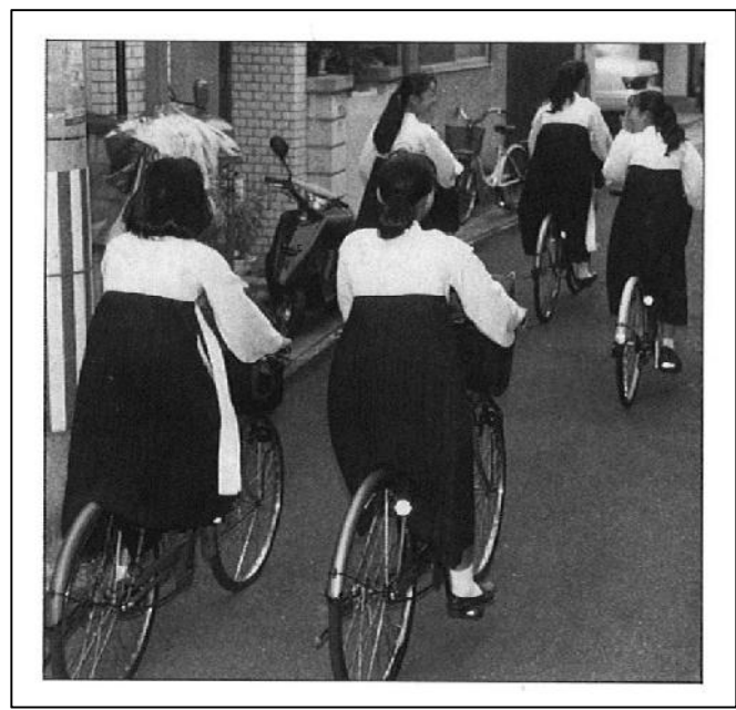
Annex 7. Pictures of Korean traditional uniform dress of Korean school's female students, ripped uniform and school bag of Korean school children