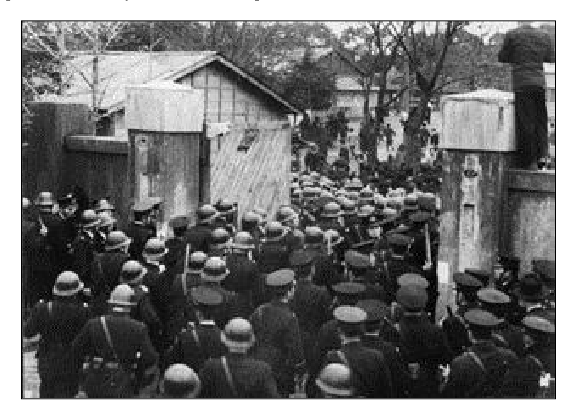
Annex 1. Pictures of compulsory closedown of Korean schools in 1948 by the Japanese authority and Allied Occupation Forces