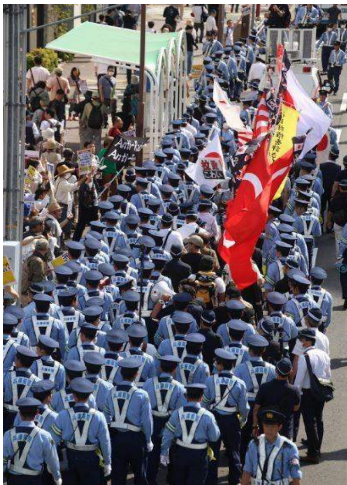
(The picture shows a row of hundreds of police officers who surround and protect about 30 participants of hate demonstration who holds "recapture the abduction victims" in Kobe City, Hyogo Prefecture on June 3, 2018.)

Even today, organizing hate demonstration and making hate speech against unspecified groups are legal and the practice of the police protecting a small number of hate demonstrators by a large number of officers almost every time, restricting counter-protests and protecting discriminatory demonstrations continues.